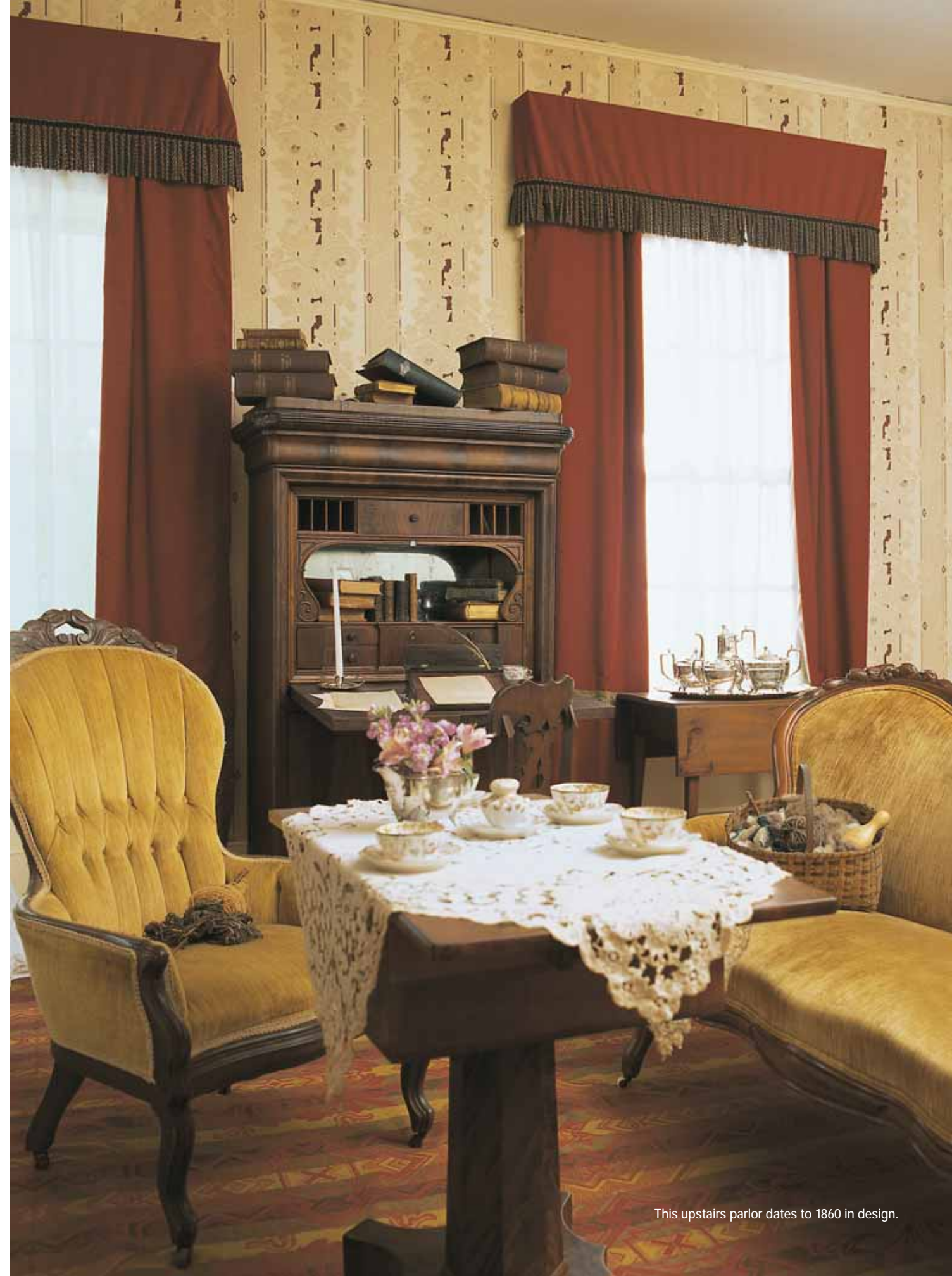
This upstairs parlor dates to 1860 in design.

All of these design periods are loosely determined, however. What was