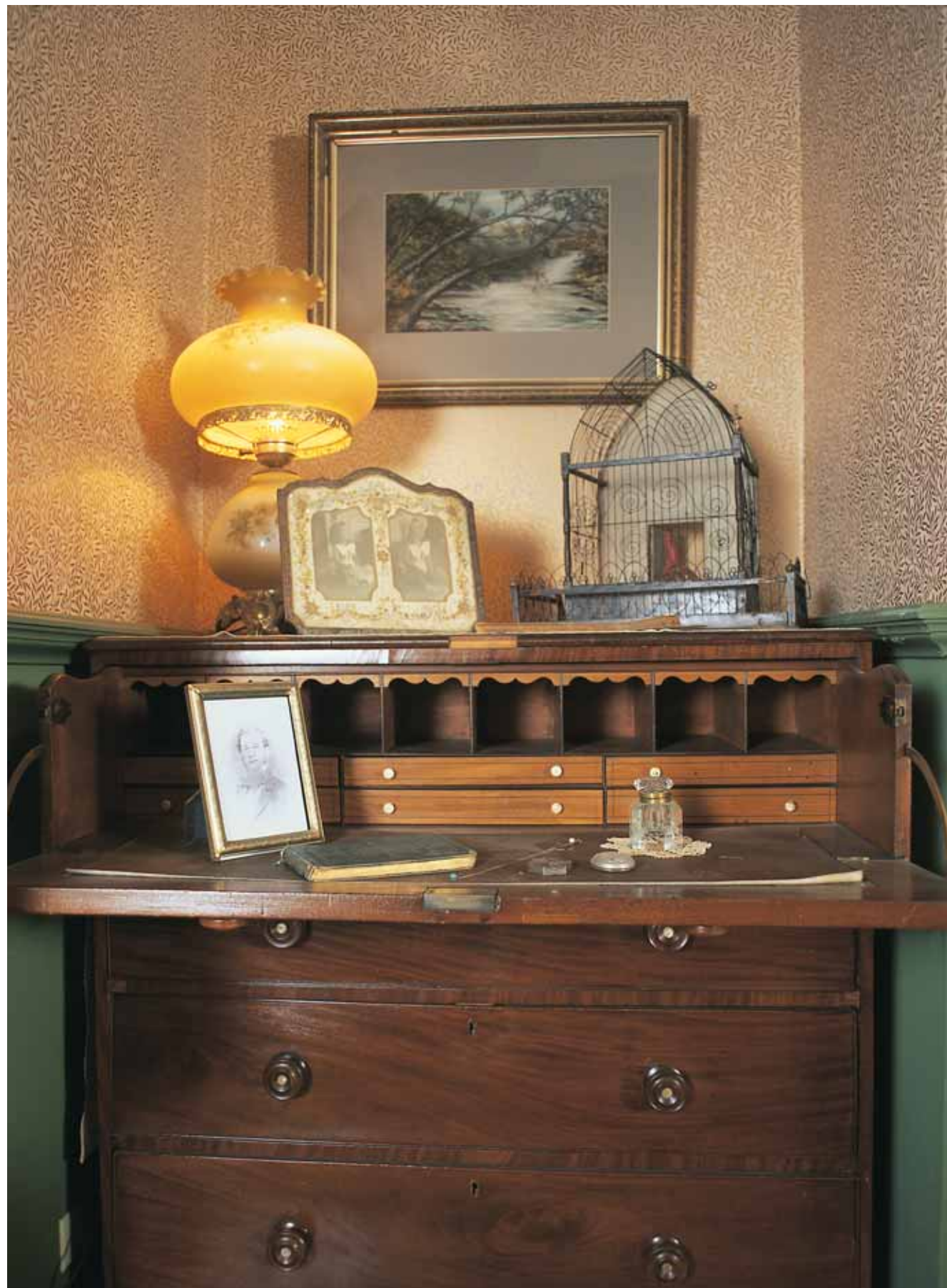
This room was designed to reflect the period of 1880. The furnishings are Eastlake and the wallpaper has what the museum staff refers to as a "Morris feeling."