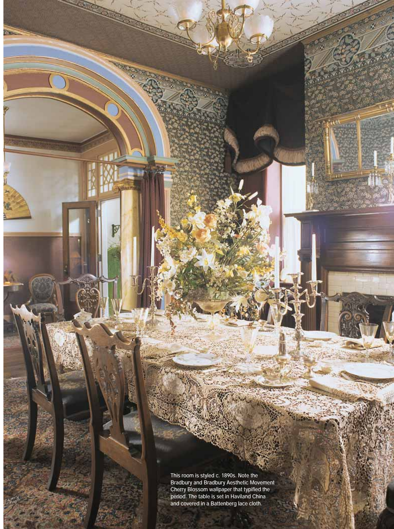
This room is styled c. 1890s. Note the Bradbury and Bradbury Aesthetic Movement Cherry Blossom wallpaper that typified the period. The table is set in Haviland China and covered in a Battenberg lace cloth.

In fact, this is more the rule than the exception. Rarely will one find a house, either historic or contemporary, that